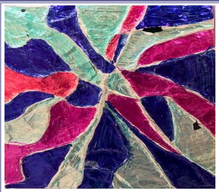
Ethan LaPine, Grade 3 Northeast Elementary School