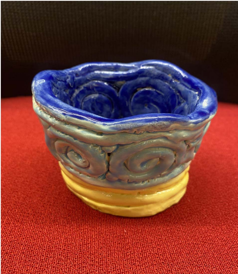
Cathleen Guinta, Grade 5, Westover